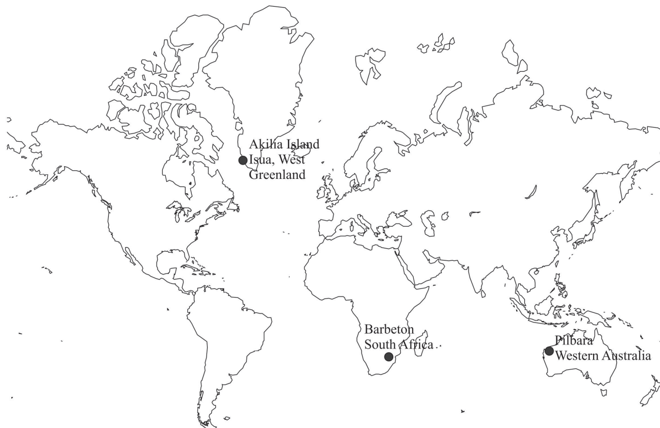
Figure 1. Location of the three sites with Eoarchean (Isua and Akilia Island, Greenland) and Paleoarchean (Pilbara, Australia and Barbeton, Africa) crust rocks.

for the generation of graphite are proposed (Fedo and Whitehouse, 2002). The debate over the interpretation of the Akilia rocks continues into the present day, although the sedimentary chemical origin of the BIFs was claimed again and supported by studies of iron isotopes (Dauphas et al. , 2004). Another possibility is that the BIF could have originated from a seawater derivation; this was suggested and interpreted as a parallel to the existence of modern mid-ocean ridge hydrothermal vents (Dauphas et al. , 2007). This finding was rebutted, however, after the reexamination of new apatite samples, as well as the study of original crystals. Petrographic studies by means of optical microscopy and scanning electron microscopy (SEM), combined with energy-dispersive spectrometry from apatite samples, could not definitively find evidence of any graphite inclusion in these samples (Lepland et al. , 2005). This lack of graphite was supported by a petrographic study of 92 apatite samples (Nutman and Friend, 2006). Nevertheless, the controversy around this record continues: McKeegan et al. (2007) claimed they had unearthed ancient evidence of life, as well as the presence of graphite, in the Akilia samples using Raman confocal spectroscopy. However, new studies again refuted the presence of the world's oldest biosignatures on Akilia. Applying U-Pb analytical methods and isotopic data, it was demonstrated that the