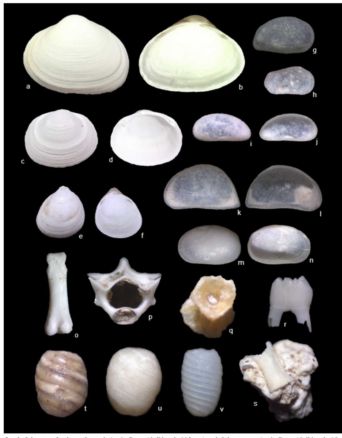
Figure 3. a, b: Sphaerium cf. sulcatum Lamarck, Acatita Dunes (shell length: 16.3 mm). c, d: Sphaerium sp., Acatita Dunes (shell length: 6.8 mm). e, f: Pisidium compressum Prime, Acatita Dunes (shell length: 3.2 mm). g: Cyprideis salebrosa van den Bold, juvenile, external lateral view, right valve, Acatita Dunes (length: 1.2 mm). h: Limnocythere ceriotuberosa Delorme, adult female, external lateral view, right valve, Acatita Dunes (length: 1.1 mm). h: Limnocythere ceriotuberosa Delorme, adult female, external lateral view, right valve, Acatita Dunes (length: 1.1 mm). j: Fabaeformiscandona caudata Kaufmann, juvenile, external lateral view, left valve, Acatita Dunes (length: 1.1 mm). j: Fabaeformiscandona caudata Kaufmann, juvenile, internal lateral view, left valve, Acatita Dunes (length: 1.5 mm). l: Candona punctata Furtos, adult female, internal lateral view, left valve, Acatita Dunes (length: 1.5 mm). l: Candona punctata Furtos, adult female, internal lateral view, left valve, Acatita Dunes (length: 1.5 mm). l: Candona punctata Furtos, adult female, internal lateral view, left valve, Acatita Dunes (length: 1.5 mm). l: Candona punctata Furtos, adult female, internal lateral view, left valve, Bilbao Dunes (length: 1.2 mm). n: Cyprideis salebrosa van den Bold, adult female, external lateral view, left valve, Bilbao Dunes (length: 1.2 mm). n: Cyprideis salebrosa van den Bold, adult female, external lateral view, left valve, Bilbao Dunes (length: 1.2 mm). n: Cyprideis salebrosa van den Bold, adult female, external lateral view, left valve, Bilbao Dunes (length: 1.2 mm). p: Vertebrae, Acatita Dunes (length: 2.5 mm). q: Fish vertebrae, Acatita Dunes (diameter: 1.8 mm). r: Mammal tooth, Acatita Dunes (length: 2.8 mm). s: Bone in sediment, Bilbao Dunes (length: 2.5 mm). t: Chara globularis Thuill., Bilbao Dunes (height: 0.8 mm). u: Chara vulgaris L., Acatita Dunes (height: 0.7 mm). v: Chara filiformis Hertzsch, Acatita Dunes (height: 0.4 mm).