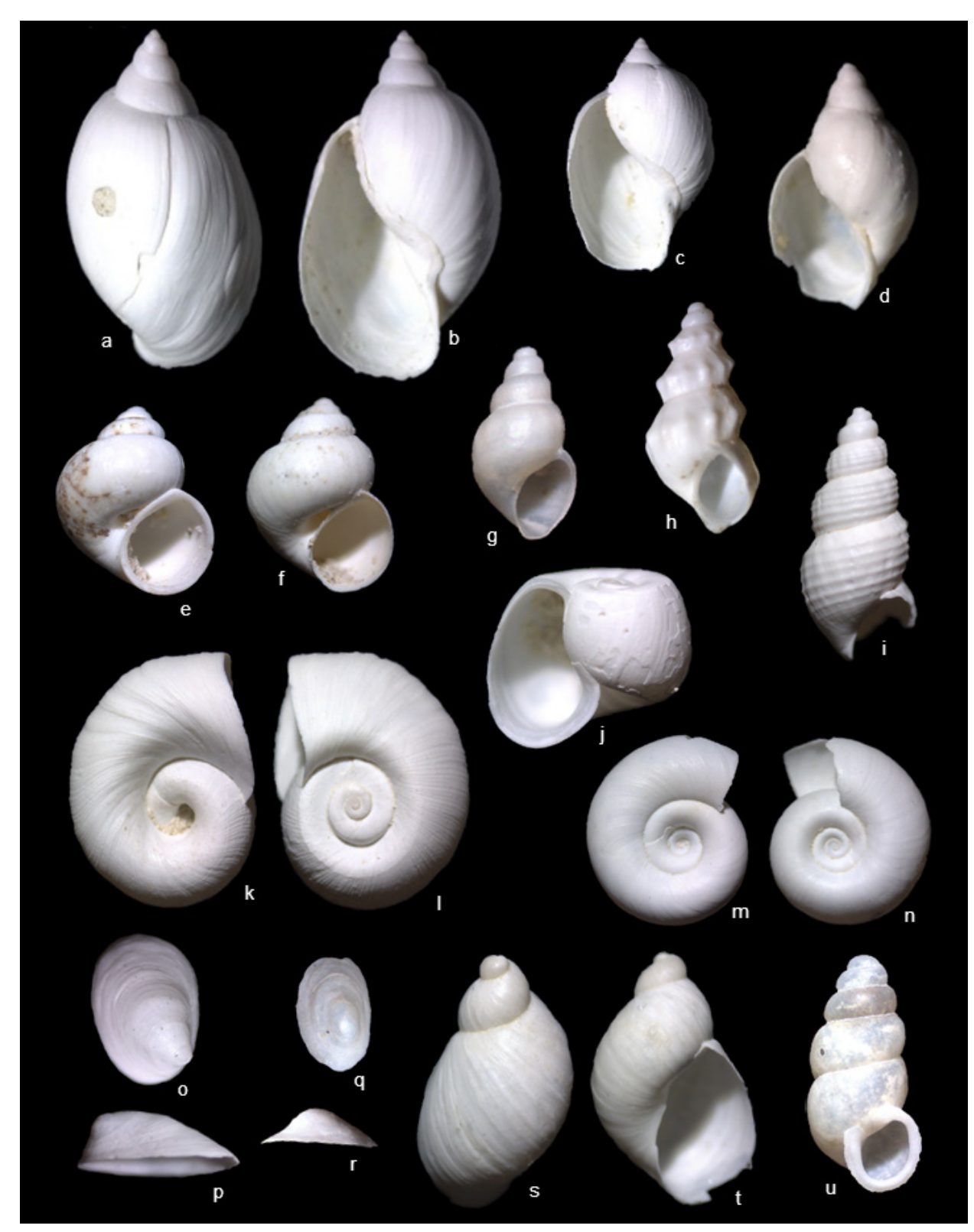
Figure 2. a, b: Physa acuta Draparnaud, Acatita Dunes (shell length: 15 mm). c: Physa acuta Draparnaud, Acatita Dunes (shell length: 12 mm). d: Physa acuta Draparnaud, Acatita Dunes (shell length: 11 mm). e: Pyrgulopsis sp. 1 (spec. novum), Acatita Dunes, Pleistocene edge (shell length: 4.1 mm). f: Pyrgulopsis sp. 1 (spec. novum), Acatita Dunes, Pleistocene edge (shell length: 4.2 mm). g: Tryonia sp. 3 (spec. novum, group " clathrata "), Acatita Dunes, Pleistocene edge (shell length: 3.4 mm). i: Tryonia sp. 3 (spec. novum, group " clathrata "), Acatita Dunes, Pleistocene edge (shell length: 3.4 mm). i: Tryonia sp. 3 (spec. novum, group " clathrata "), Acatita Dunes, Pleistocene edge (shell length: 3.4 mm). i: Tryonia sp. 3 (spec. novum, group " clathrata "), Acatita Dunes, Pleistocene edge (shell length: 3.4 mm). j: Planobella sp. (scalaris-type), Acatita Dunes (shell width: 7.1 mm). k, l: Planobella sp. (cf. P. duryi Wetherby), Acatita Dunes (shell length: 3.9 mm). q, r: Ferrissia fragilis Tryon, Acatita Dunes (shell length: 6.1 mm). o, p: Ferrissia sp. 1 (spec. novum?), Acatita Dunes (shell length: 3.9 mm). q, r: Ferrissia fragilis Tryon, Acatita Dunes (shell length: 9.9 mm). w: Pupoides albilabris (C.B. Adams), Acatita Dunes (shell length: 3.7 mm).