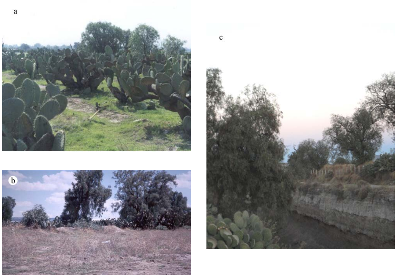
Figure 3. Landscape features at sites studied in the Teotihuacan Valley: a. Tlajinga; b. Otumba; c. San Pablo.